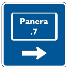
Business Directional Signage For Business Off the Trail Example

A Business Directional Sign will cost $500 per year. Money will be used to maintain signs and amenities along the trail.