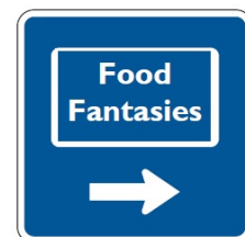
Business Directional Signage For Business On the Trail Example